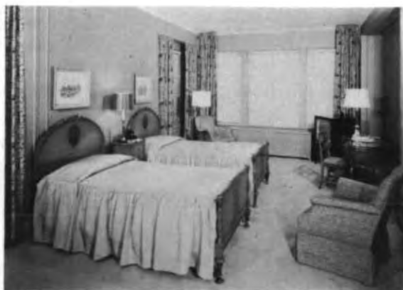
A typical room.