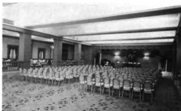
The Colonial Room for meetings.