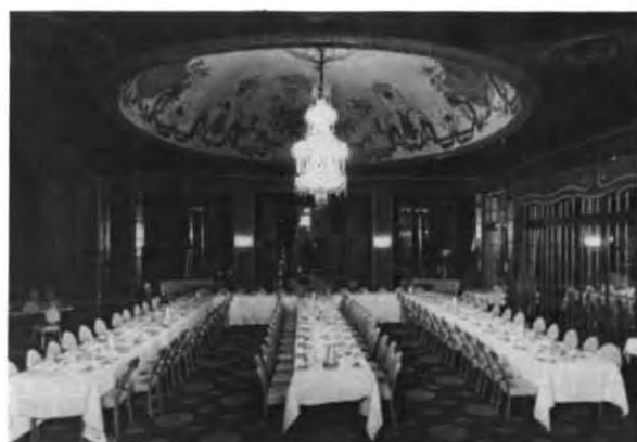
The Chinese Room for special events or meetings.