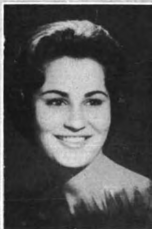
Gen Wilmer Arizona Alpha Hi and Smile Queen