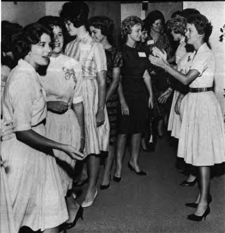
"COME BE A PI PHI; EVERYBODY COME"—at Memphis State.