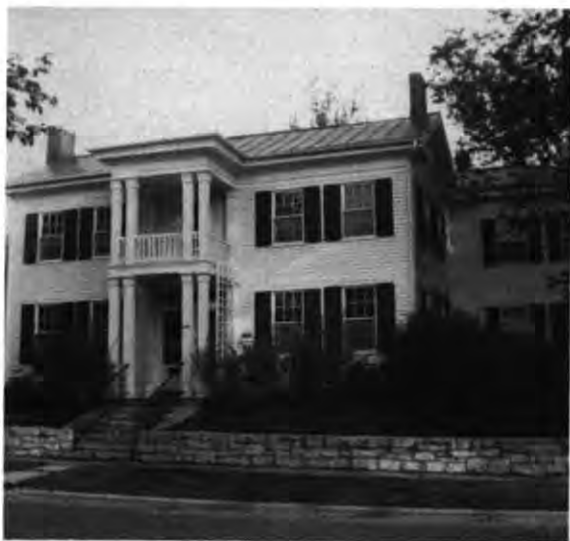
Holt House today.