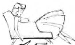
—and this . . .