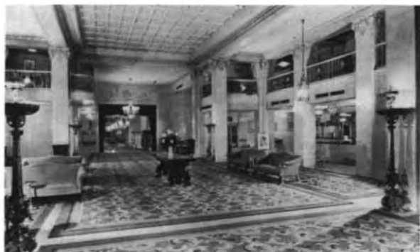
The Mayflower Lobby.