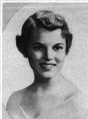
Sydney Seville Virginia Gamma