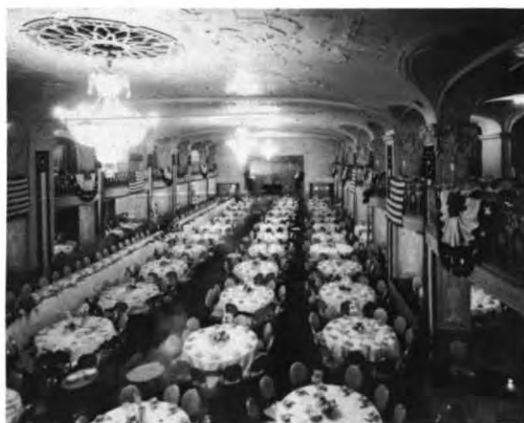
The Grand Ballroom where 1,312 people can be seated.