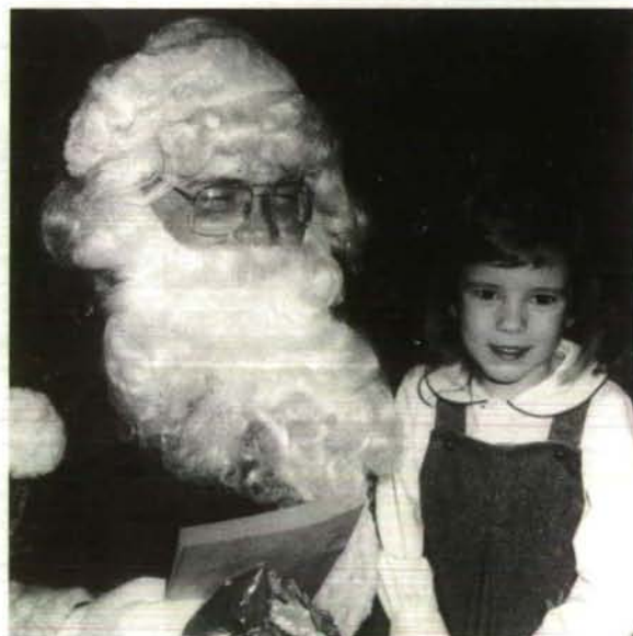
Santa listens to a little girl from a local elementary school as she tells him what she wants for Christmas. She was one of many underprivileged children entertained at the Phi Gamma Delta-Kansas Alpha Rug Rat Christmas party at the University of Kansas.

The shop is staffed primarily by volunteers. It features a wide variety of needlepoint materials and specialty gift items.