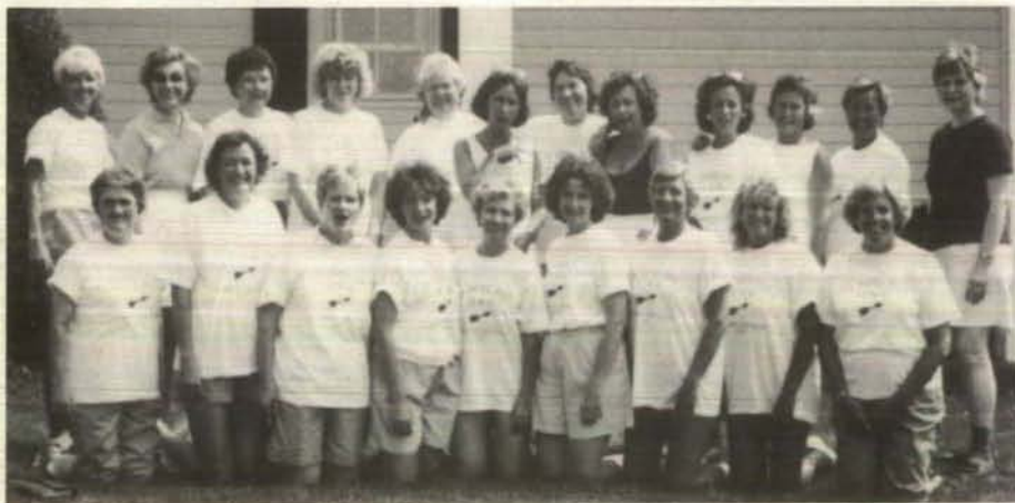
Twenty-one Pennsylvania Epsilon Pi Phis from as far away as Yakima, WA gathered last July in Herndon, VA for a weekend of remembering. They all picked up where they left off 27 years ago and agreed that sisterhood truly is more than skin deep!

Other sororities were invited to share in the opportunity. The event was especially beneficial to incoming freshmen and transfer students, and was an overall benefit to the entire chapter. It helped New Mexico Alphas learn more about their university and the programs available to students. The large breadth of information covered helped the girls recognize just how many opportunities college life holds.