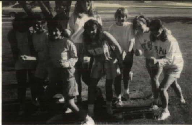
Washington Gammas are all set to begin a Crop Walk for World Hunger in which funds were donated to the World Hunger Organization.

Arkansas Betas also took cookies and candy to the children of the Arkansas Pediatrics facility on Halloween and Christmas.