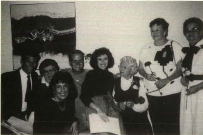
Texas Etas and the Aggie Mens Club, a Christian social fraternity, visited the Bryan Convalescent Center to sing Christmas carols to the elderly. All the ladies were given red carnations to top off the fun.

OHIO BETA raised over $400, took 1st place overall in games and 2nd place for the Most Spirited Award during Phi Kappa Tau's Halloween philanthropic project. All the money raised was used to buy a Leader Dog for the Blind.