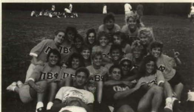
Texas Epsilons flag football team, the Pi Phi Packers, advanced to the Texas regionals after claiming 1st place at North Texas State. At regionals, they finished as one of the four top teams.