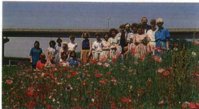
Members of the Baton Rouge Alumnae Club look over the beauty of their handy-work.