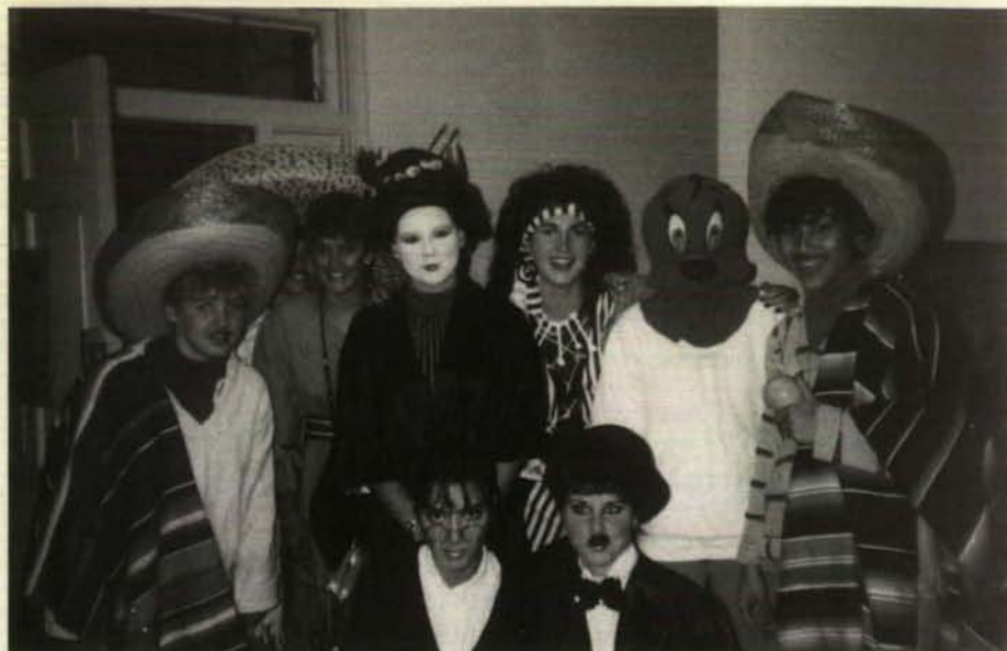
Michigan Gammas, in disguise, decorated an area retirement home and brought smiles to the faces of all involved.