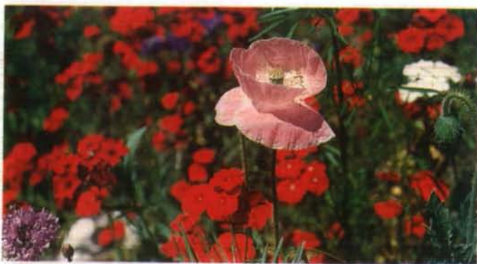
These wild flowers surely bring admiring smiles to travelers on the Baton Rouge interstate system.