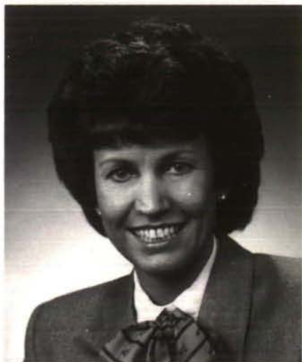
Washington State's Professor of the Year.