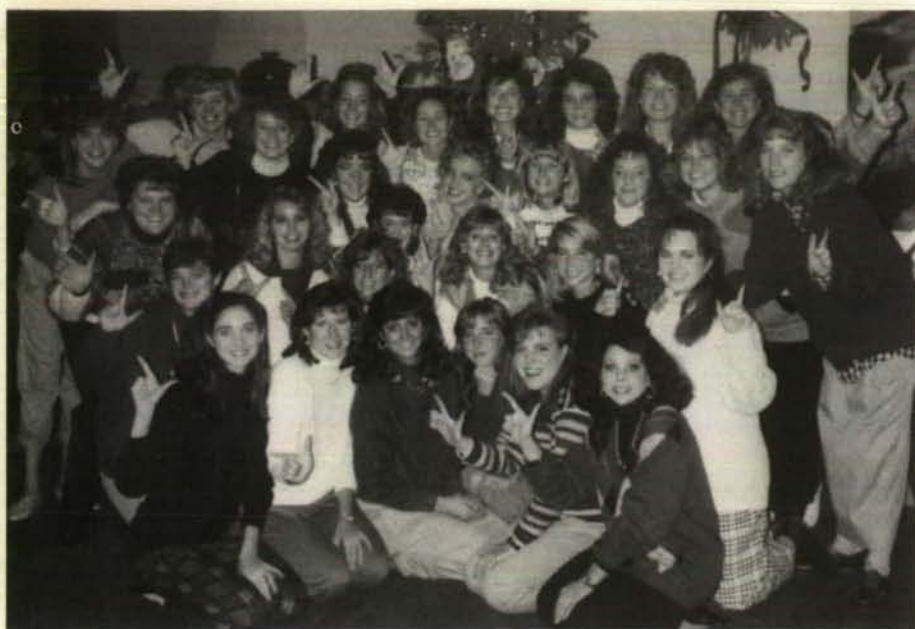
Last fall Texas Gammas took a break from studying and went on a retreat to Santa Fe, NM. Not only is Santa Fe a beautiful place to relax, but it also holds historical meaning to Texas Gamma. Ko Shari, the social club that became Pi Phi at Texas Tech, held initiation at Santa Fe.